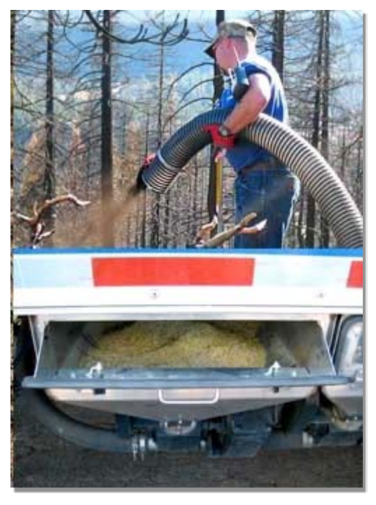
Photograph CB-1. Application of a compost blanket to a disturbed area.

Compost blankets can be used as an alternative to erosion control blankets and mulching to help stabilize disturbed areas where sheet flow conditions are present. Compost blankets should not be used in areas of concentrated flows. Compost provides an excellent source of nutrients for plant growth, and should be considered for use in areas that will be permanently vegetated.